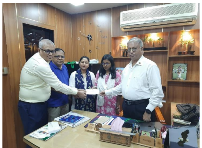
Handover of Cheque